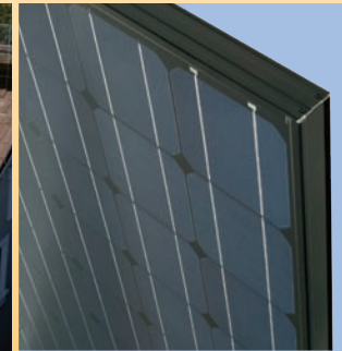
Laminated glass construction in a high torsion frame.